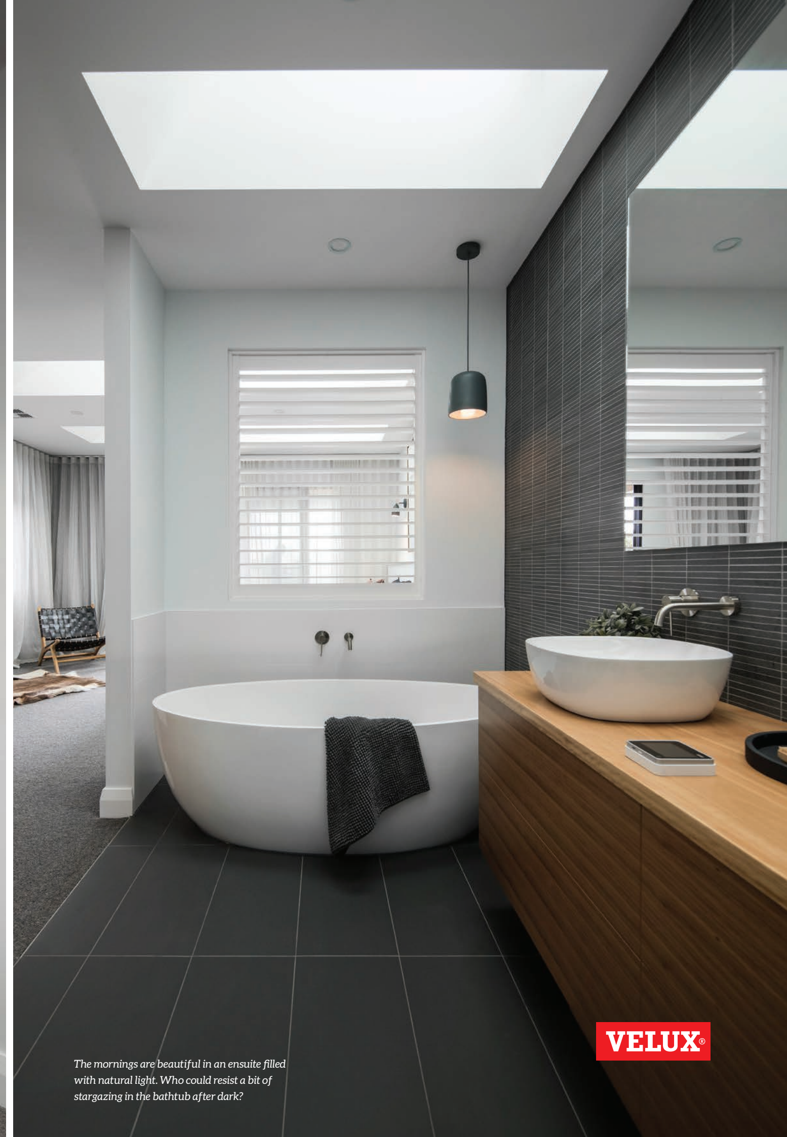
The mornings are beautiful in an ensuite filled with natural light. Who could resist a bit of stargazing in the bathtub after dark?