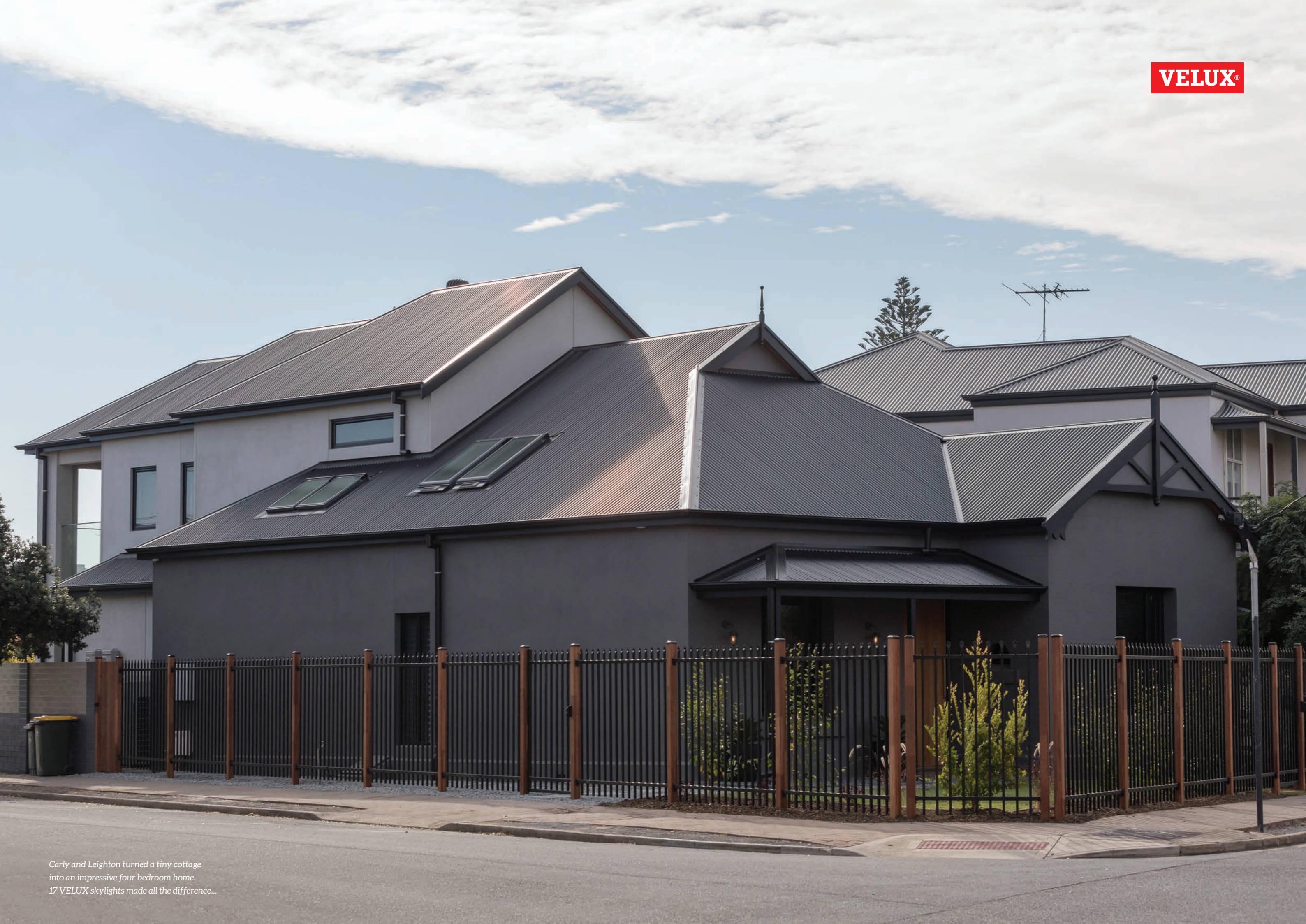
Carly and Leighton turned a tiny cottage into an impressive four bedroom home. 17 VELUX skylights made all the difference...