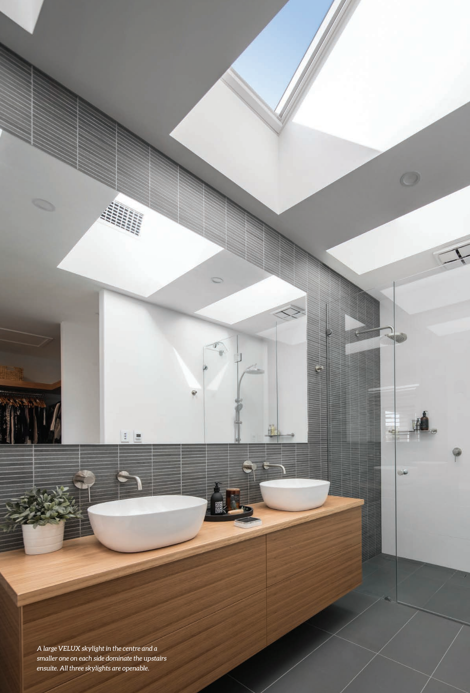
A large VELUX skylight in the centre and a smaller one on each side dominate the upstairs ensuite. All three skylights are openable.