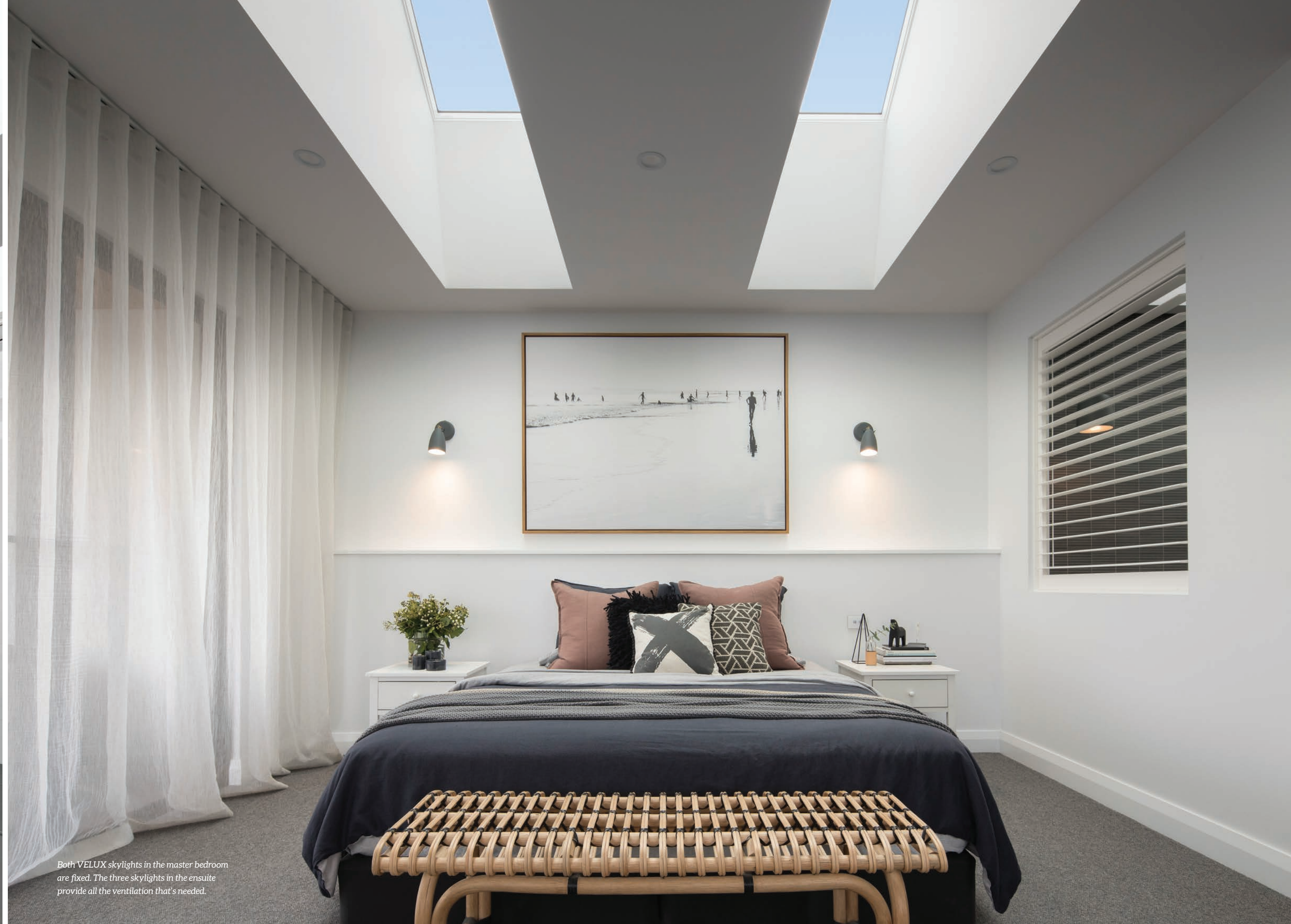
Both VELUX skylights in the master bedroom are fixed. The three skylights in the ensuite provide all the ventilation that's needed.